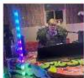
Et on & More

This dynamic & powerful indie band bangs out classics from The Killers, The Verve, Oasis and more!